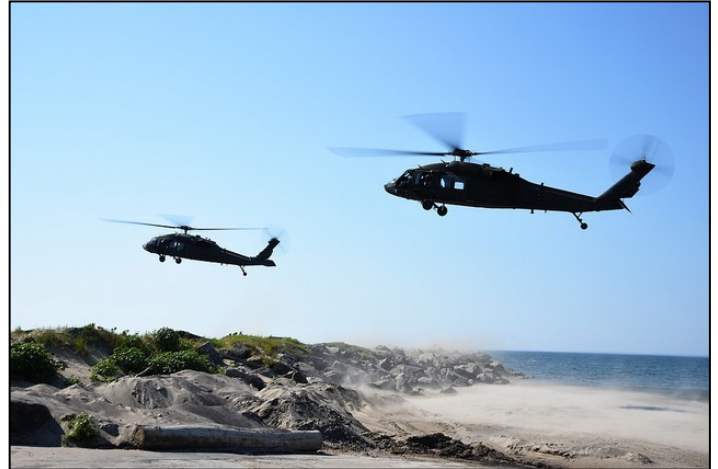
Virginia National Guard flight crews provide aviation support to Soldiers assigned to the West Virginia National Guard's 19th Special Forces Group Sept. 5, 2018, over Lake Erie near Buffalo, New York.