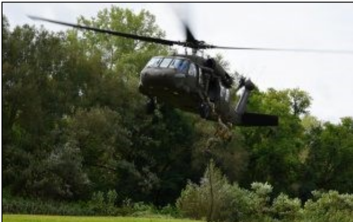
Virginia National Guard flight crews help prepare special operators assigned to the West Virginia National Guard's 19th Special Forces Group for deployment with fast rope training Sept. 6, 2018, near Buffalo, New York.