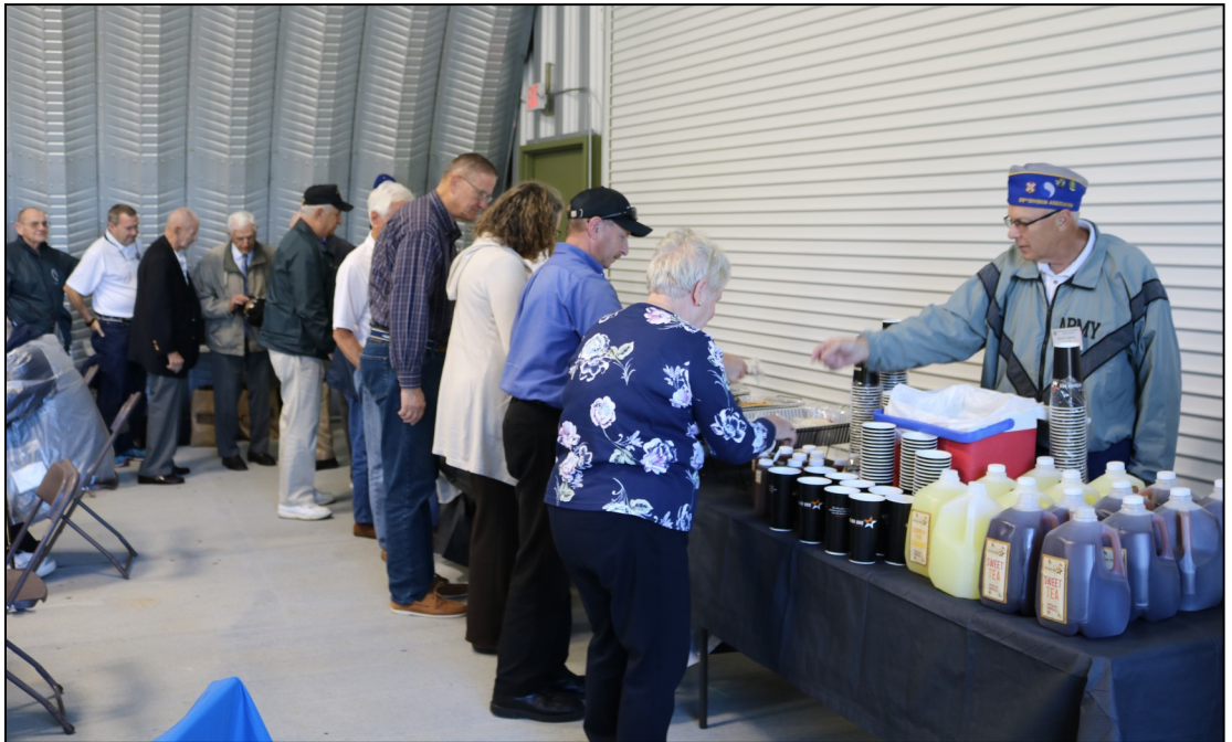
After touring the grounds, reading the many plaques and viewing the magnificent collection of sculptures and statuary, the group was treated to lunch in one of the World War II era Quonset Huts. The 29th Division band provided entertainment and our good friends at Mission Barbeque provided the food.