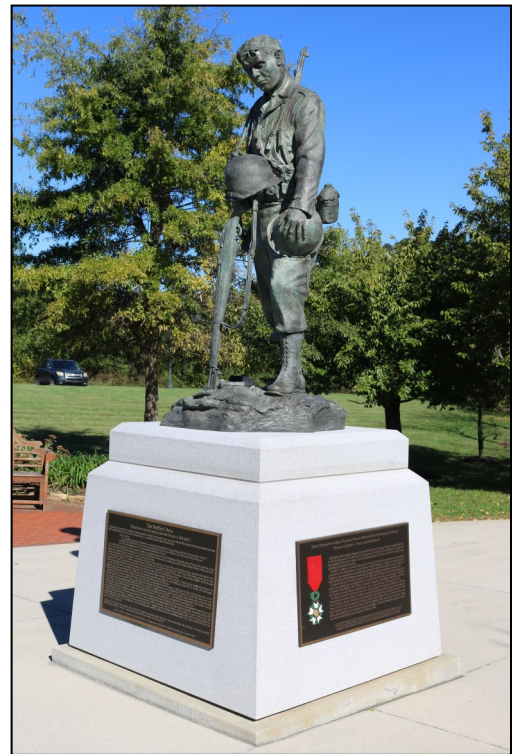
"Bedford Boys" Statue